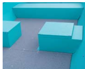
• Split seat (DN B-14SST)