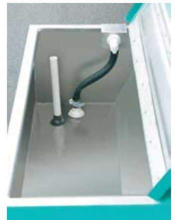
• Port side aerated livewell (DN 16SST)

Color: Seafoam Green exterior with Aquamarine interior.