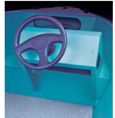
• Optional Console