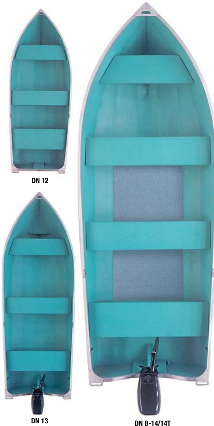
Shown with optional Floorboard Kit.

Color: Seafoam Green exterior with bold graphics, Aquamarine interior.