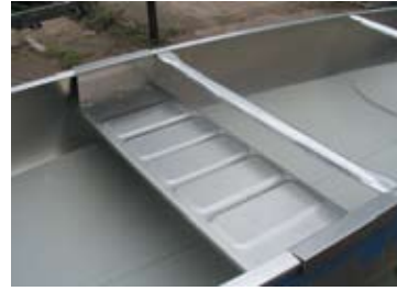
Center Seat Kit. Tough .080" aluminum seat for solo paddling or carrying an extra passenger. Fits all Grumman Canoes with a 35" to 37" beam.