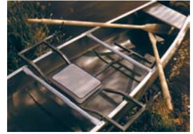
Row Rig. Easy-on, easy-off rig with oarlock sockets lets you row your Grumman Canoe. Fully Adjustable. Shown with opt. Canoeist Cushion. Oars not included.