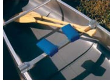
Carrying Yoke. Specially cushioned yoke fits all Grumman Canoes up to 37" in beam. Shown with opt. River Paddles, available in 4 1/2' and 5' lengths.