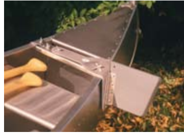
Motor Bracket. This side mount motor bracket fits all Grumman double-enders.