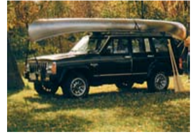
Canoe Topper Combo. This multi-purpose cartop carrier kit includes tie downs, sponge blocks to protect your canoe and car, and over-the-roof strap.

All Grumman Canoes meet or exceed all safety standards established by American Boat and Yacht Council (ABYC). Dimensions, capabilities, ratings and additional specifications plus complete warranty and service information are available from your dealer. All product illustrations and data within this catalog are based on information available at the time of publication. Hull weights are approximate. Due to publishing errors, on-going product modifications and/or component part availabilities, the manufacturer reserves the right to make changes without notice or obligation. You are advised to consult your local dealer for the most current product specifications prior to purchase. Some of the equipment shown separately or on products illustrated in this catalog may be optional at extra costs.