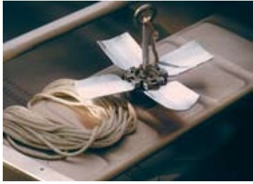
Folding Anchor. Fold it up when not in use, this sturdy anchor weighs just 2 lbs.