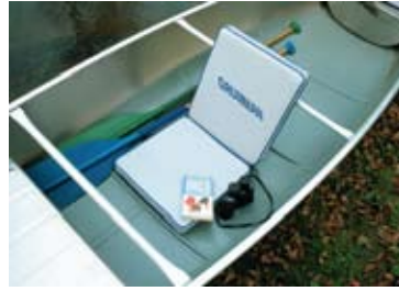
Lazyback Seat Cushion. Weather resistant folding seat with back rest for extra comfort.